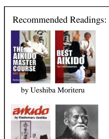
by Ueshiba Kisshomaru