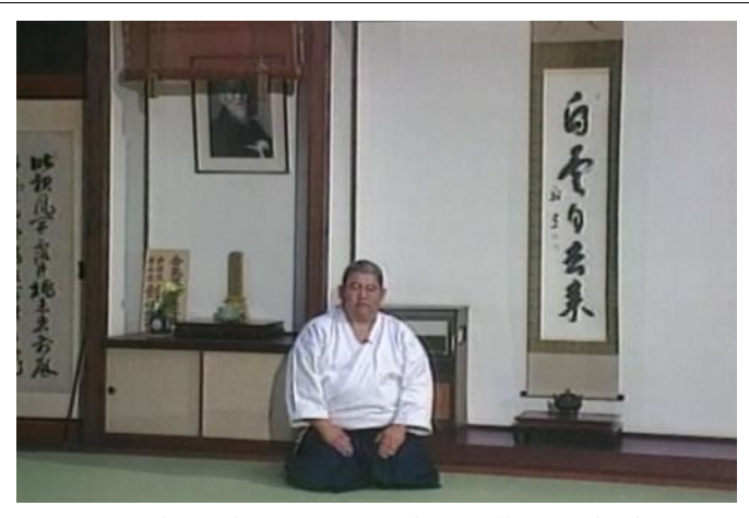
Sensei explains the meaning of the scroll (at right) his Zen master gave him in The Art of Aikido, Volume 4