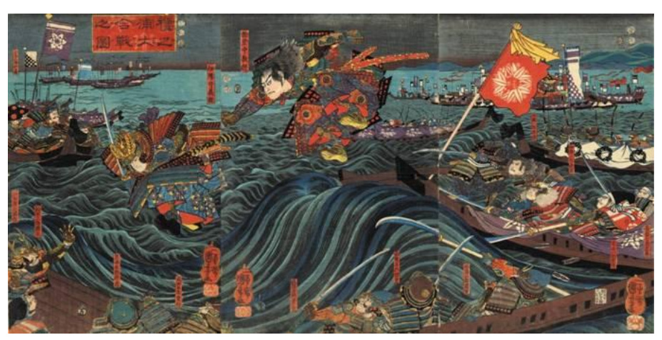
The Battle of Dan No Ura as depicted in this Kuniyoshi wood block triptych.

force attacking the front of the stockade. Yoshitsune attacked the Taira troops from the rear. He chose an incredibly steep incline, Hiyodori Goye, as the point of the cavalry attack to the undefended rear of Taira's fortress. The incline was supposedly so steep that the stirrups of the warriors touched the helmets of the warriors in front of them. It was a great defeat for the Taira. The remaining Taira, including the seven-year-old emperor Antoku, escaped to a fortress at Yashima on Shikoku.