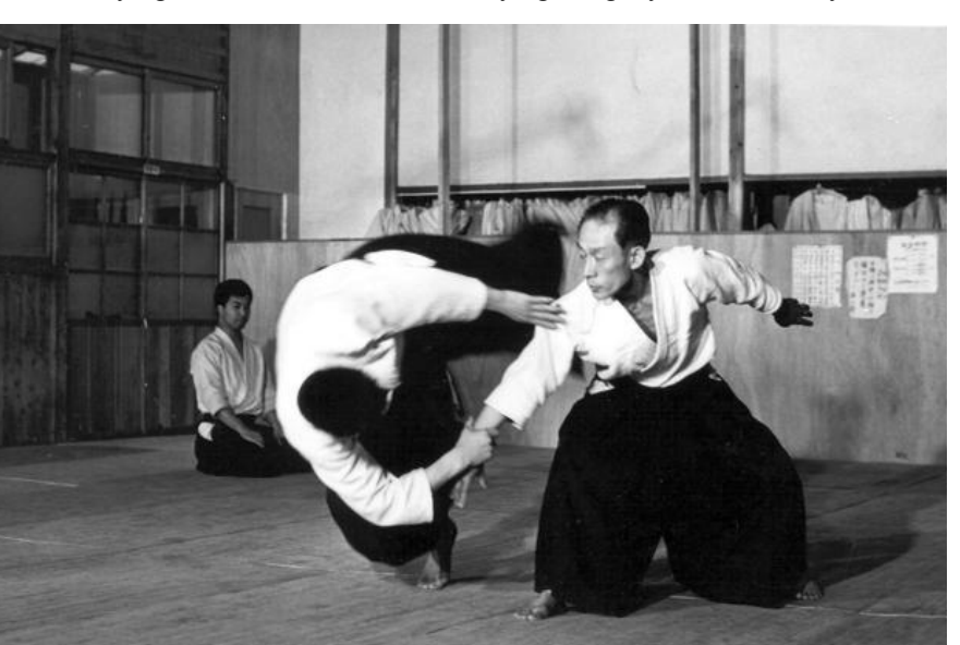
Nidai Doshu Kisshomaru Ueshiba

The United States Marines have a saying, "gung ho." When people hear the term "Gung Ho," it conjures images of enthusiasm, or hard charging Marines come to mind. While the modern definition of gung ho might be "eager" or "enthusiastic," but the original phrase in Chi-