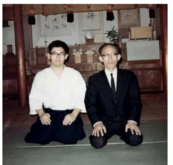
Sensei with Nidai Doshu Kisshomaru Ueshiba in 1969 at Aiki-jinja

In the spiritual world or the world of spiritual training, it is even more severe. Do not lie, do not smoke or drink too much, do not swear, do not think bad thoughts, do not be lazy, do not, do not, do not, do not! We are judged by what we do not do, we are judged by different form, to his Daily Message board on January 6, 2003. the strict ideals we bind ourselves to in order to develop and train ourselves. This is the true meaning and foundation of training.